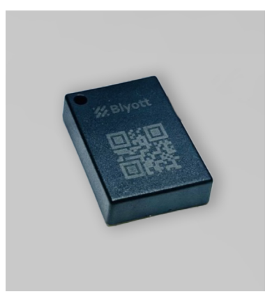
This ruggedised sensor is suitable for a variety of use cases in extreme environments and conditions.

Finally, a secure operational mode is included and based on an AES-128 crypto algorithm.